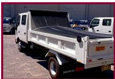
Mesh Retractable Blind