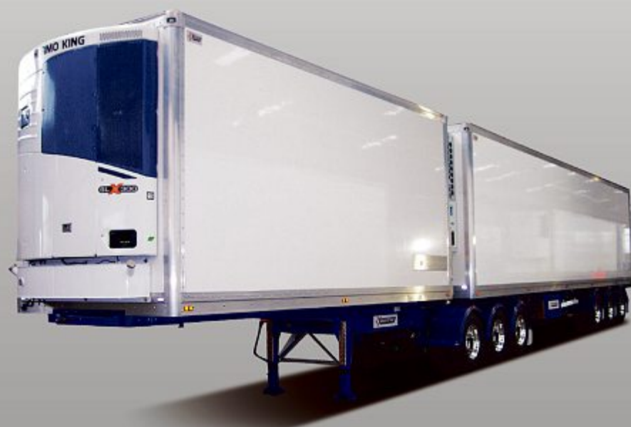
Specialised Refrigerated Transport Equipment