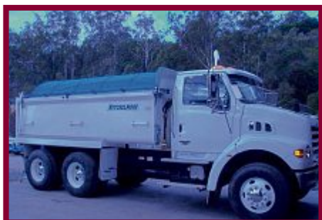
Mesh Wind Out Tarp