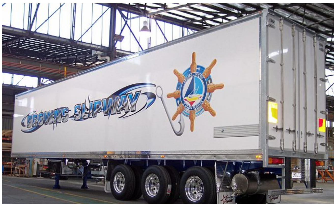
GOOD CHOICE: Browns Slipway has purchased two new 24 pallet trailers from Graystar Trailers.

The demand from new clients is quite exciting and has led to many new